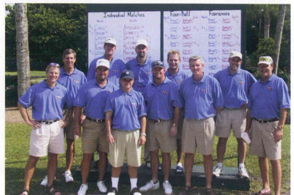
The North Team could not hold on to their 1999 Florida Cup Matches Championship title.