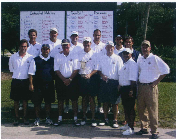
The South Team dominated the 2002 Florida Cup Matches for a second time.